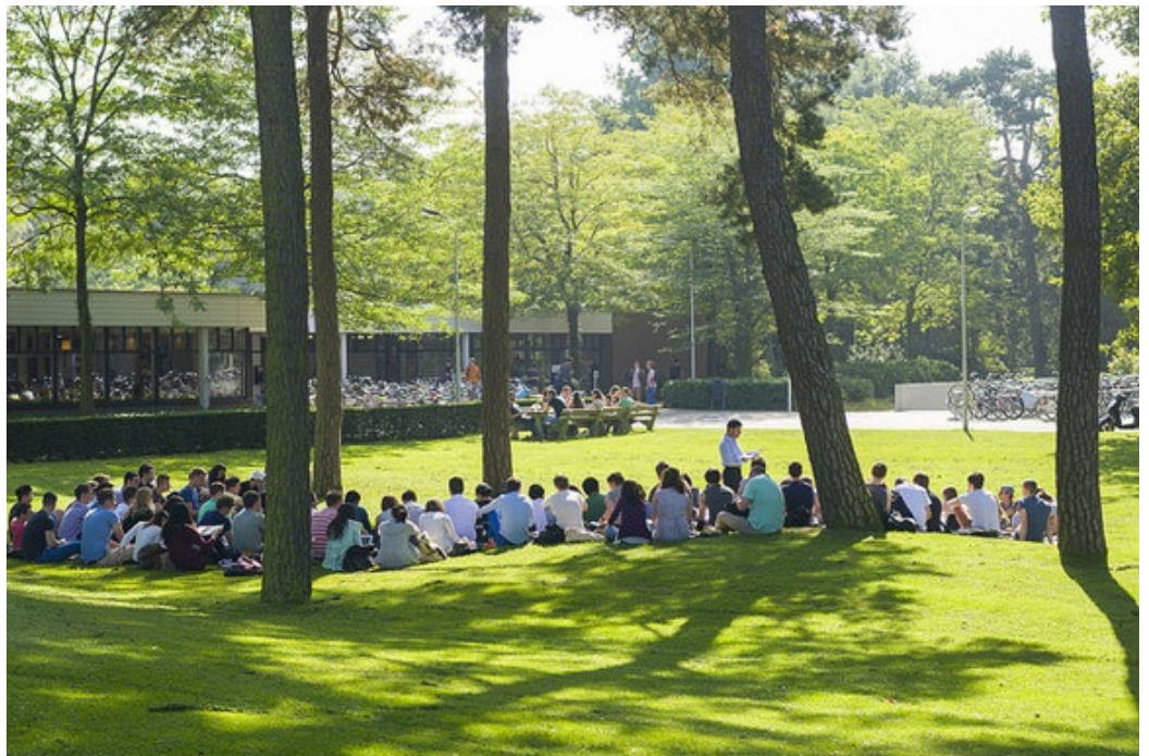
Lecture in the open air on a summer day

Tilburg University has a green campus and is located on the edge of a park-like forest. The campus itself is bustling with student activity, a contrast that makes Tilburg University a truly attractive and dynamic place for learning. Tilburg University has a modern University Library and excellent Sports Center, which are all within easy walking distance from each other. Student work spaces in every building are equipped with all the modern facilities you need to make studying on campus a pleasant experience. Organizations aimed specifically at international students organize all kinds of social activities. All ingredients are there to give you a stimulating, inspiring, and joyful campus experience.