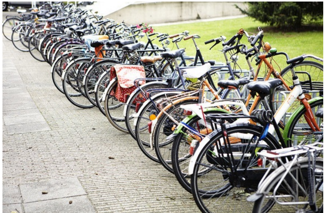
Bikes parked at the Tilburg University campus

Did you know that, for the Dutch, the bicycle is an important means of transport? In the Netherlands, you will see bikes everywhere you go. Going by bike is a fast, easy and safe way to explore the city and its surroundings and to move between the Tilburg city center and the Tilburg University campus.